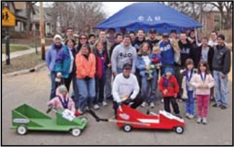
Michigan Alpha's recent ALS philanthropy efforts have raised more than $36,000.

On March 20, Michigan Alpha once again joined with Ann Arbor Active Against ALS (A2A3), a local non-profit organization, to co-host the Second Annual Boxcar Derby on South University. The event, which was open to the community and attended by a crowd of more than 100