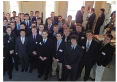
The men of Michigan Alpha today in the foyer of the chapter house during the 2010 Founders Day "meet and greet."

One of the first major steps was to address the declining condition of the historic chapter house. In the period from 1999 through the early 2000s, the Alumni As-